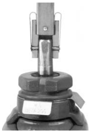
VAG KLIK-FIX The new tool-less stopping system